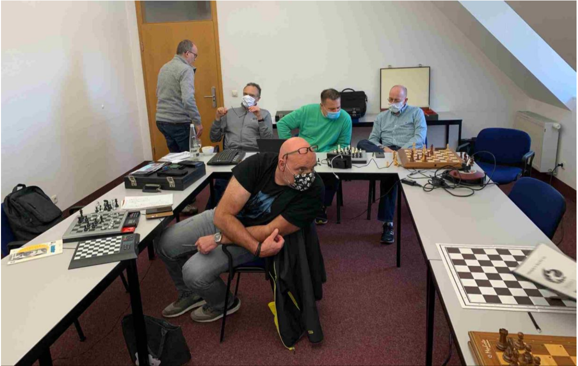
A tournament is not really necessary to have a nice weekend...