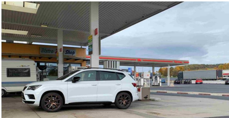
Aah... Ruud also secretly took a picture of my car.