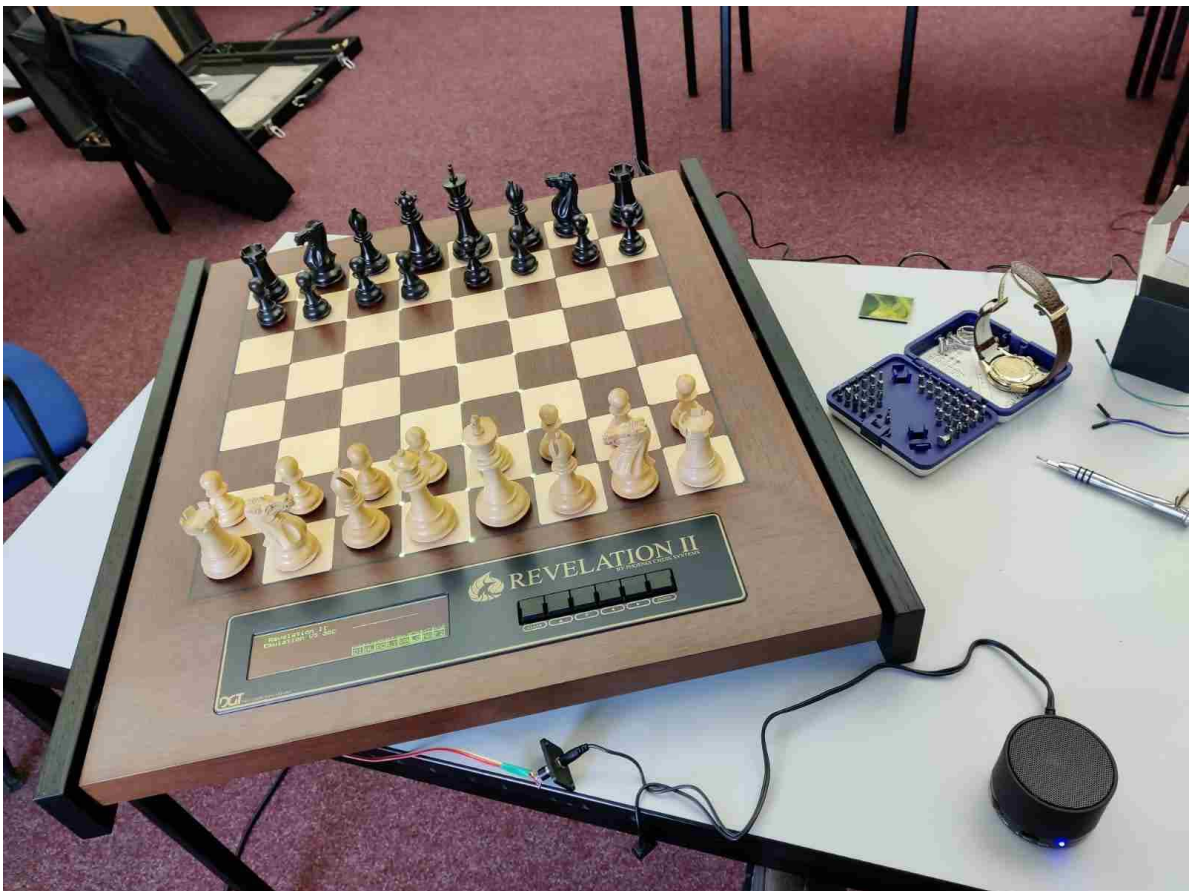
Certainly also when speakers have to be built into the Revelation II AE for the emulation of the robot voice of the Novag Robot Adversary.