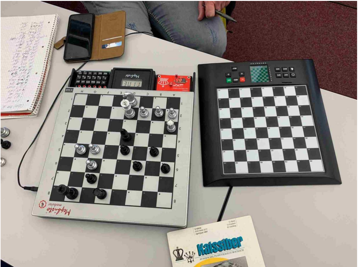
How do you do that then? You take 2 computers with you and let them against play chess with each other, while others ask questions about what you have brought with you.