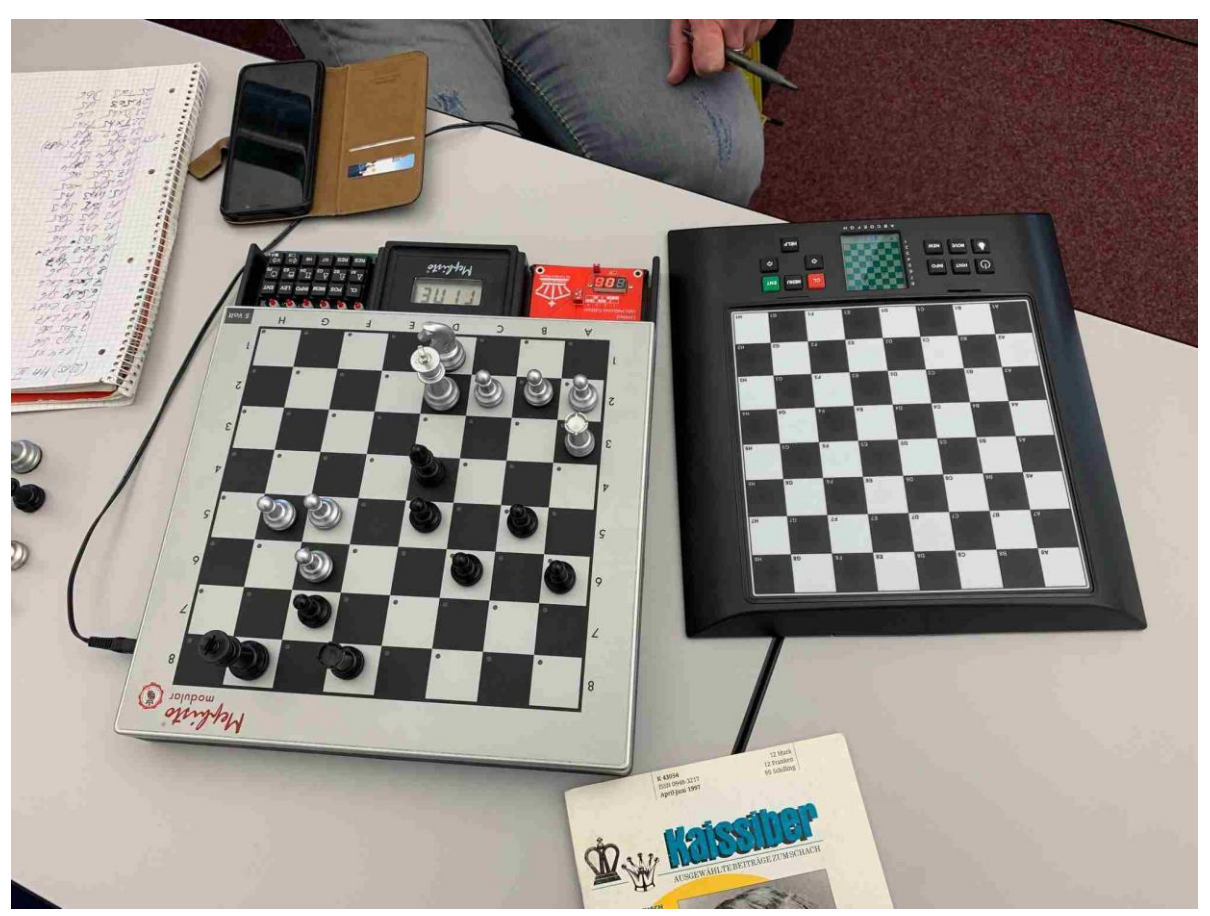
How do you do that then? You take 2 computers with you and let them against play chess with each other, while others ask questions about what you have brought with you.