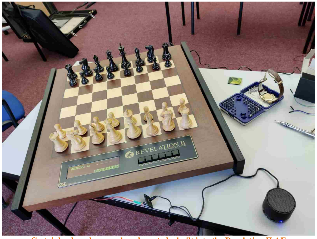
Certainly also when speakers have to be built into the Revelation II AE for the emulation of the robot voice of the Novag Robot Adversary.