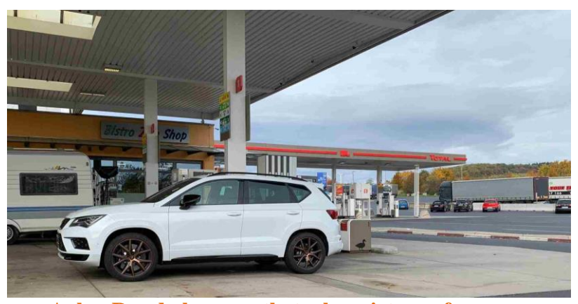
Aah... Ruud also secretly took a picture of my car.