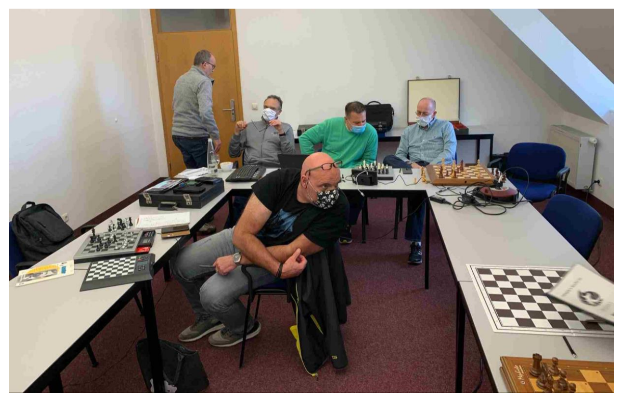
A tournament is not really necessary to have a nice weekend...