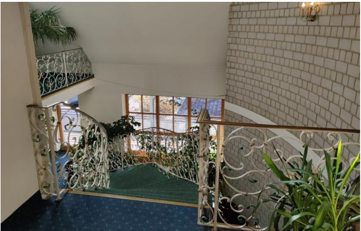
This photo is unfortunately a bit less sharp but it gives an impression of reaching your destination via the stairs.