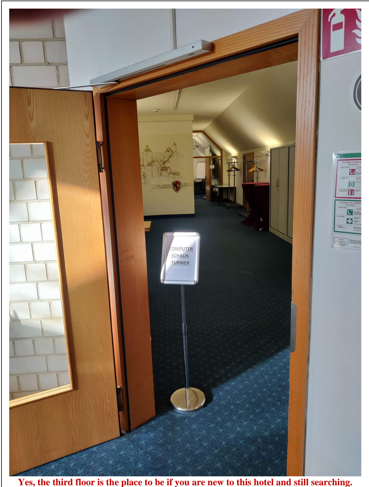
Yes, the third floor is the place to be if you are new to this hotel and still searching.