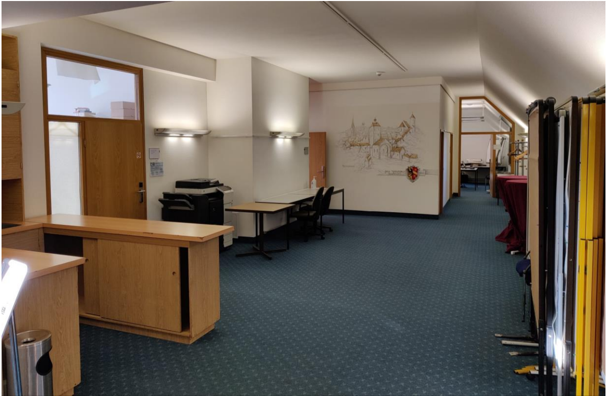
Towards the tournament rooms...