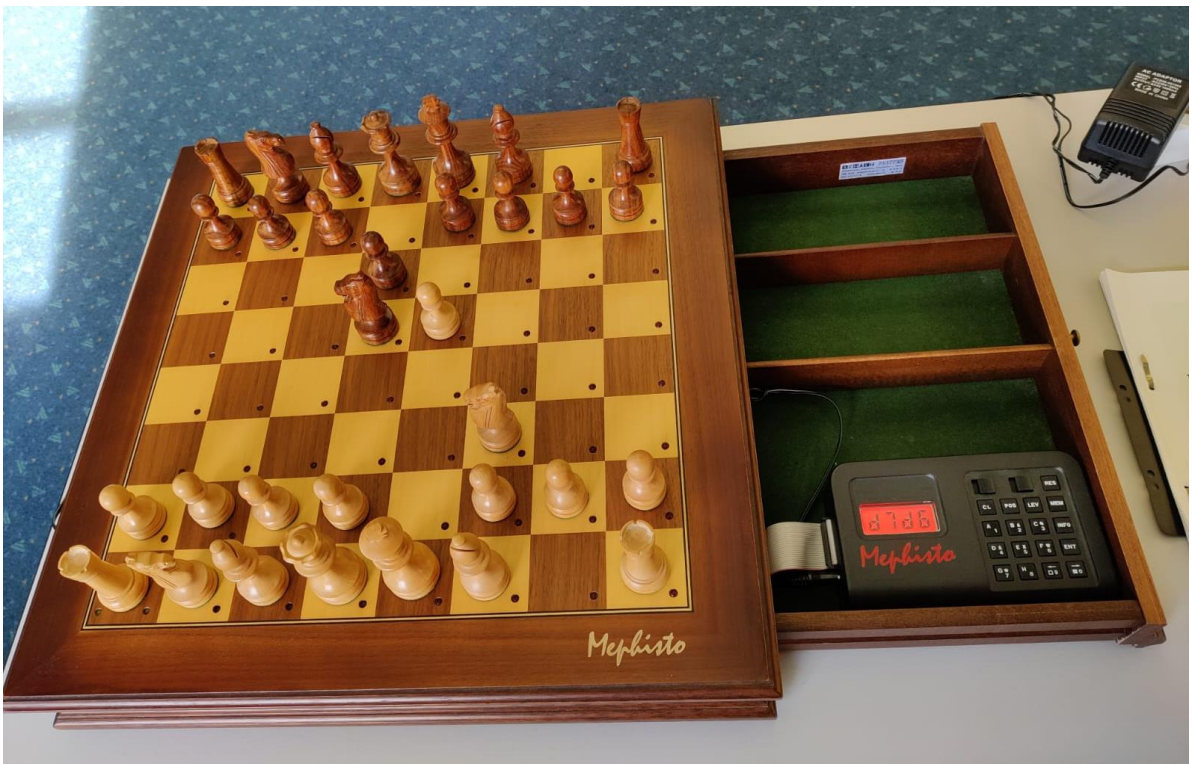
Mephisto ESB 6000 with the well-known black case from the early 1980s. The chess program GM Petrosjan with 32 MHz. is not often seen!