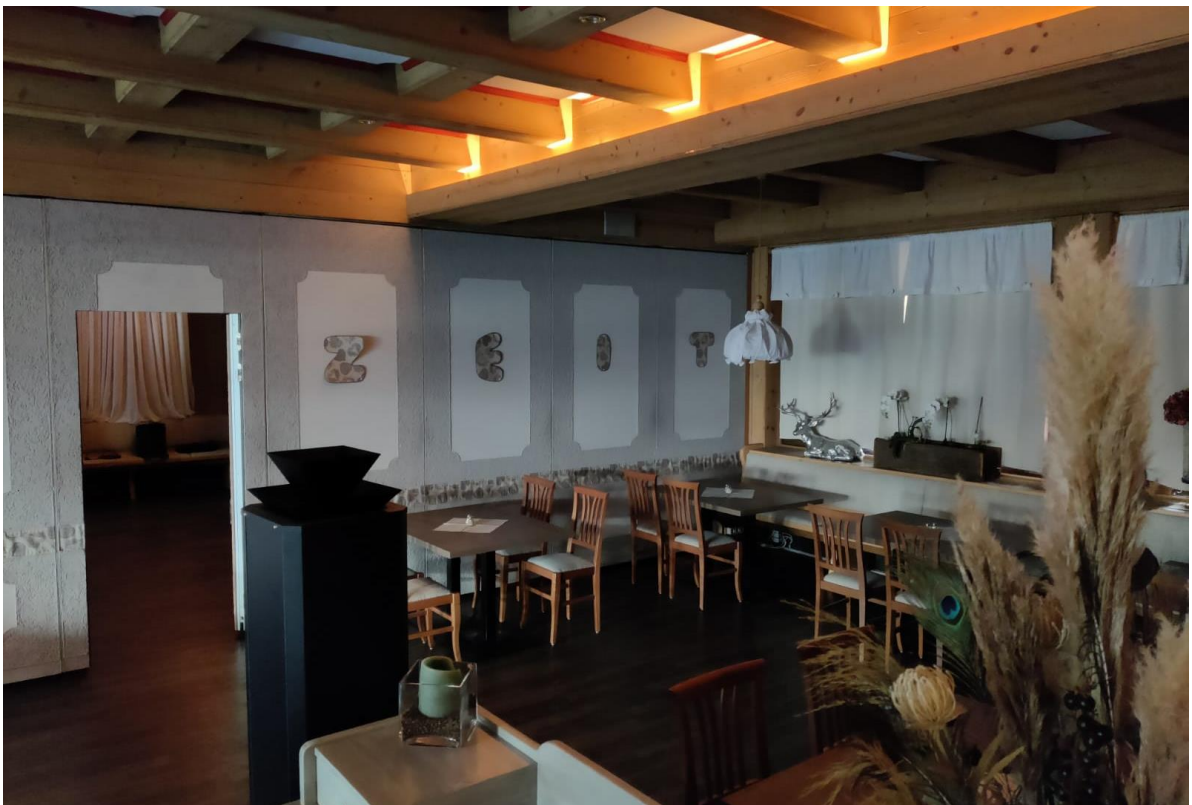
The room can be divided into two parts by a separation wall...