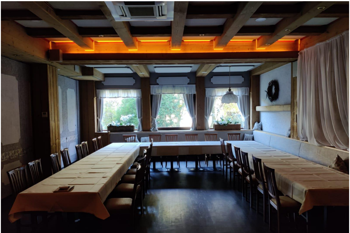
But I can assure you that this room has a lot of potential for organising a computer chess tournament here!