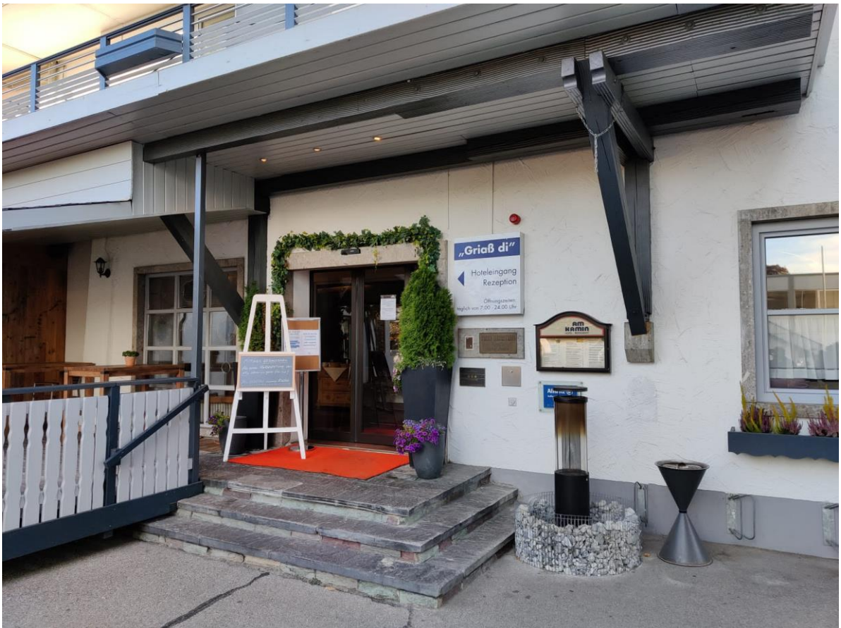
The main entrance.