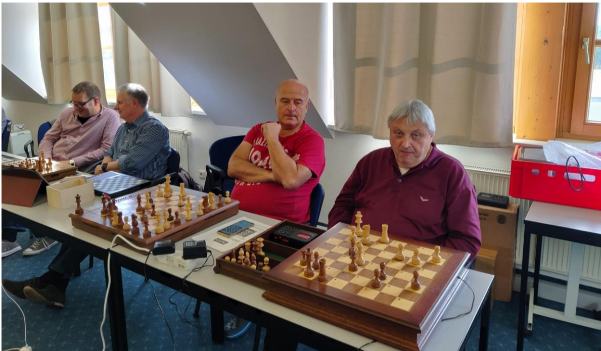
Two beautiful wooden boards of tournament size. What more could you want?