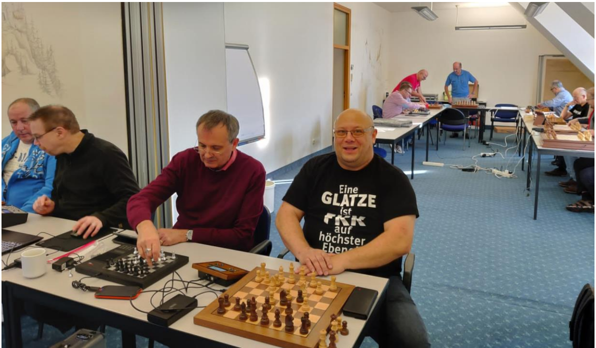
A nice look through from the A group to the B group.