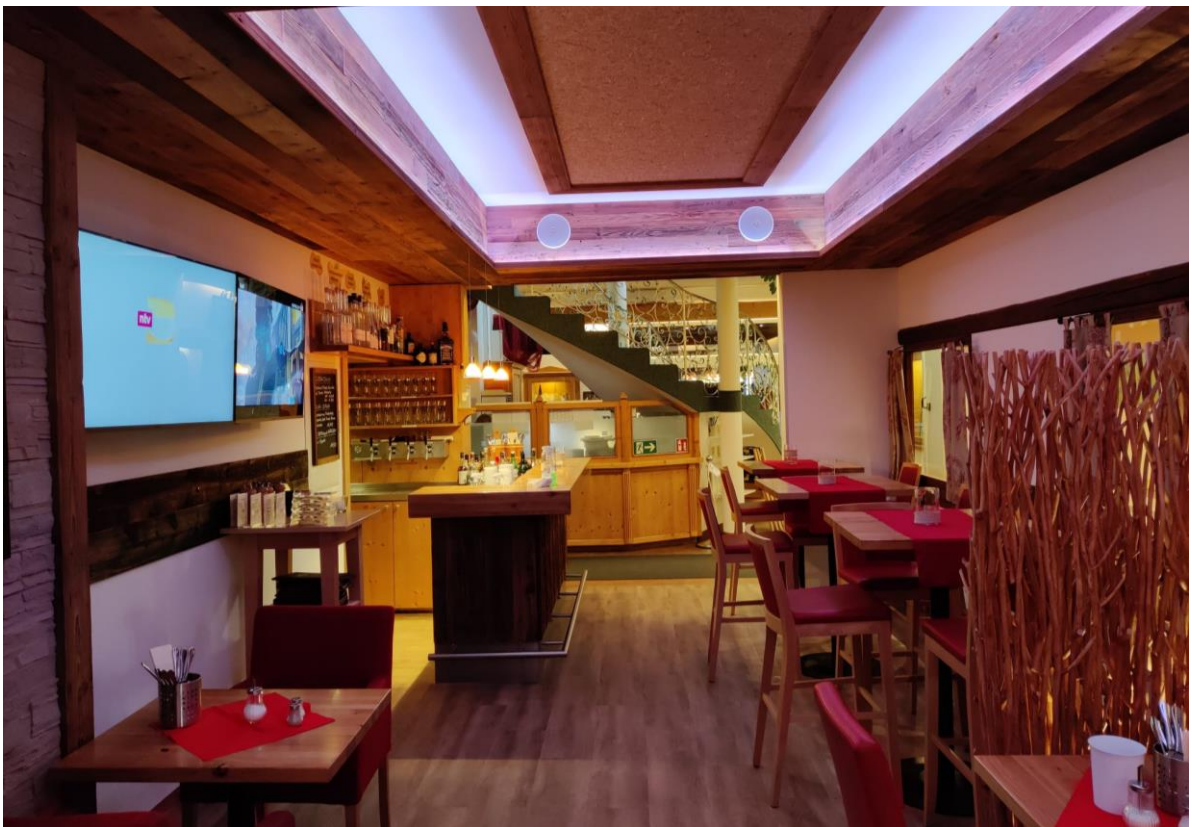
The 'Sprizzbar' is a nice place to be in the afternoon or evening hours in peace and quiet and to enjoy a drink (cocktail) and a snack in between.