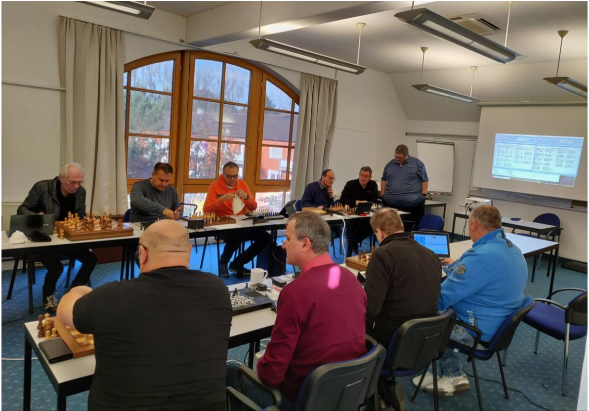
After 2 years again a tournament in Kaufbeuren...