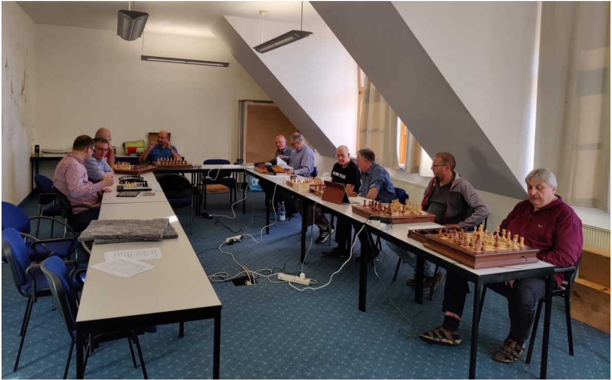
So gentlemen of the B group... is everything under control? It seems to be!