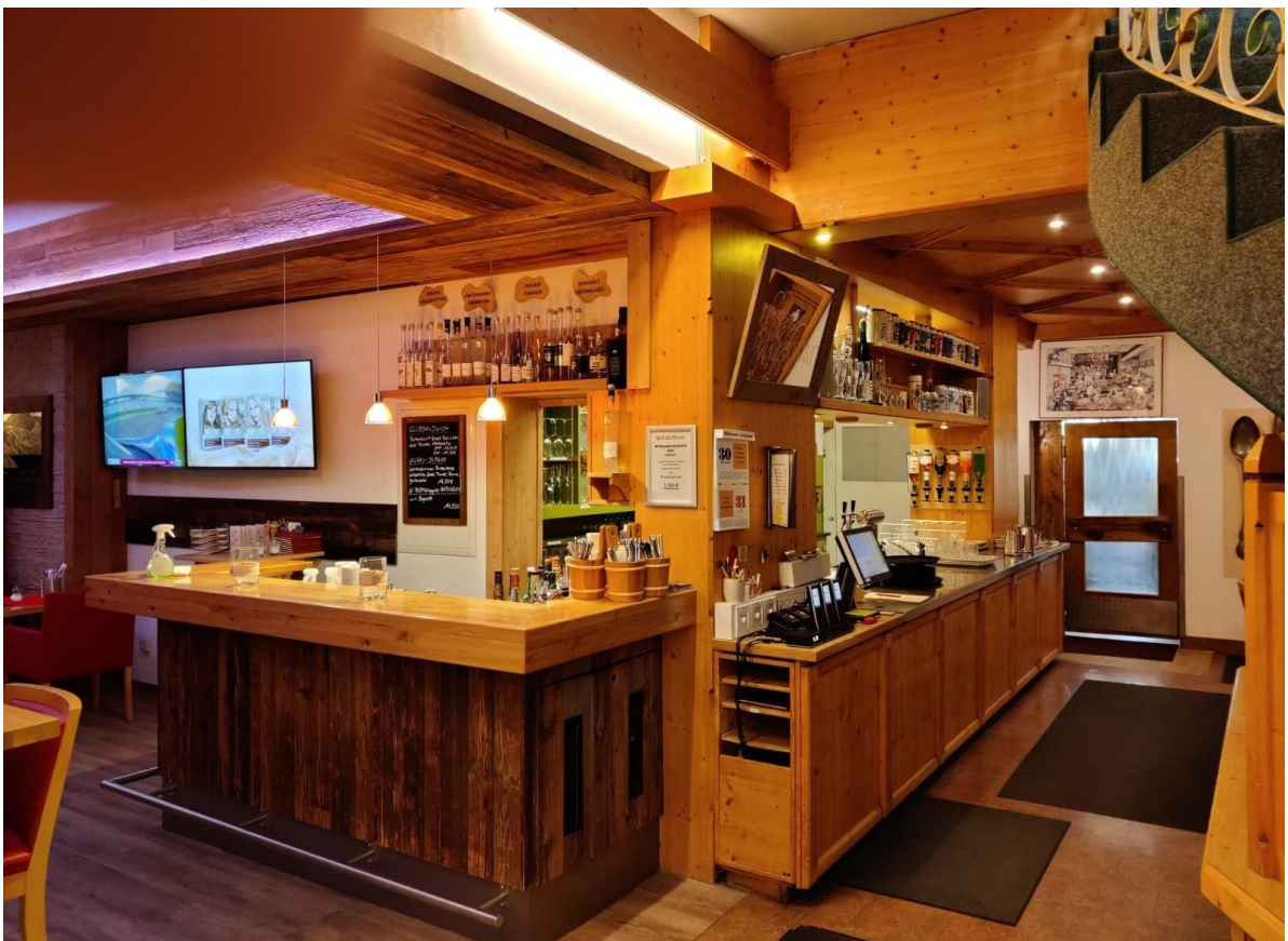
Ordering food and drink is quick and easy here. The door in the background is off-limits as it houses the kitchen.