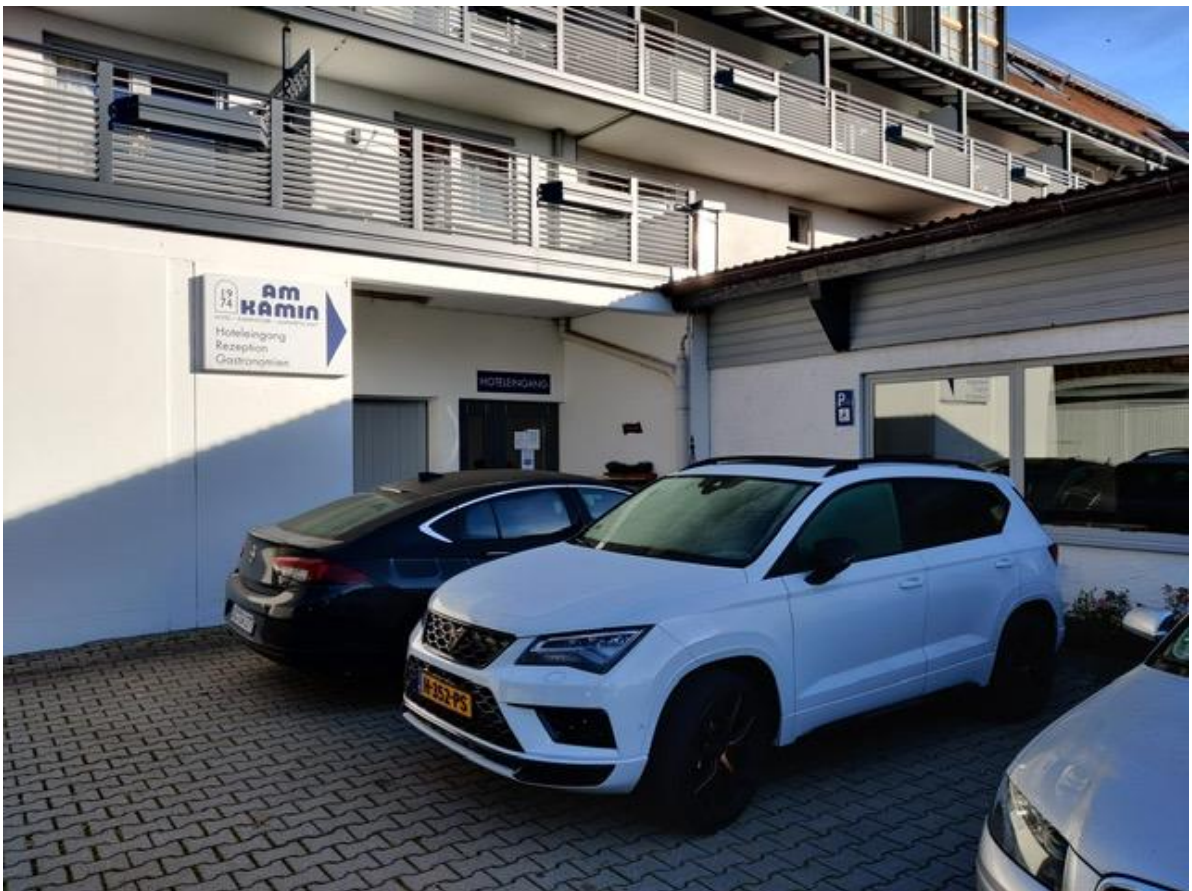
From the second car park there is also access to the hotel.