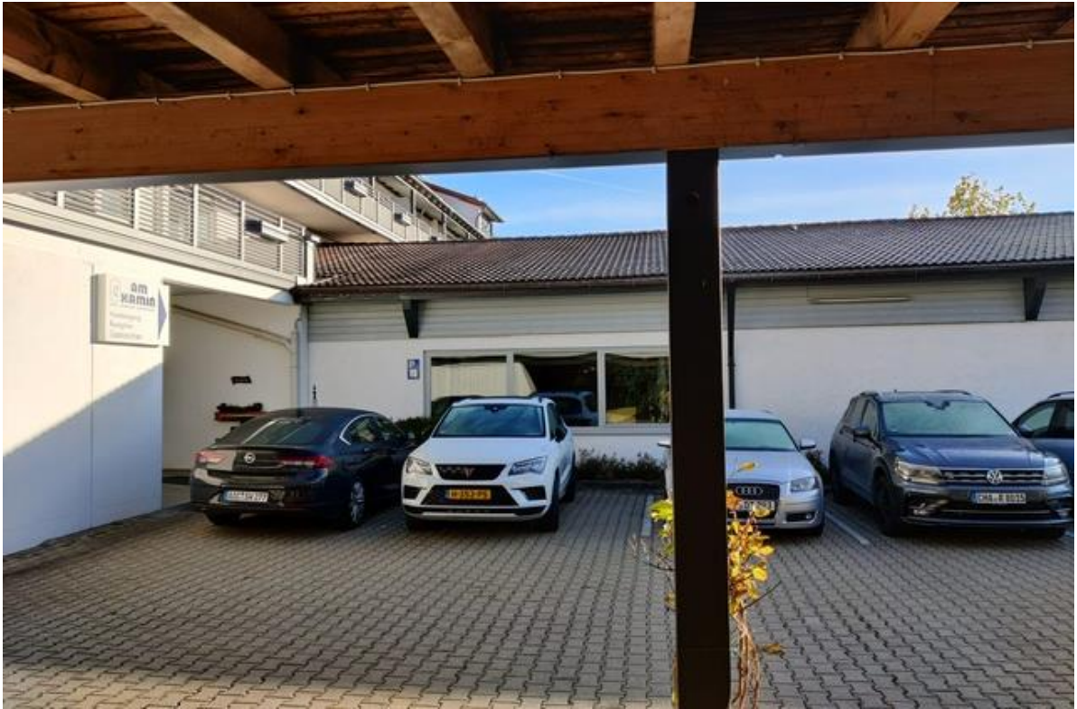
The second parking space...