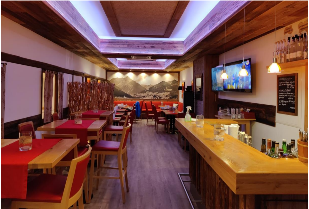
One more time the 'Sprizzbar' but then photographed from a different angle.