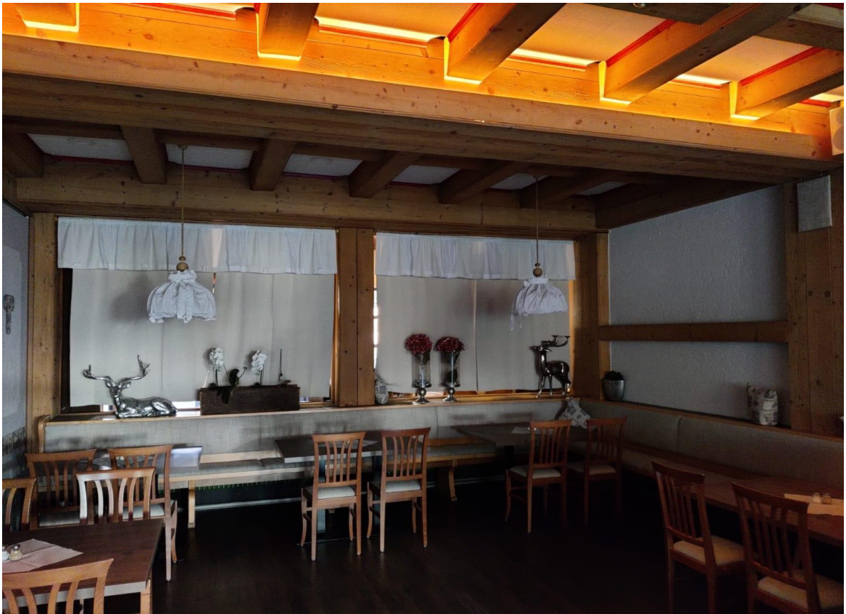
Here are some photos of the main hall on the ground floor...