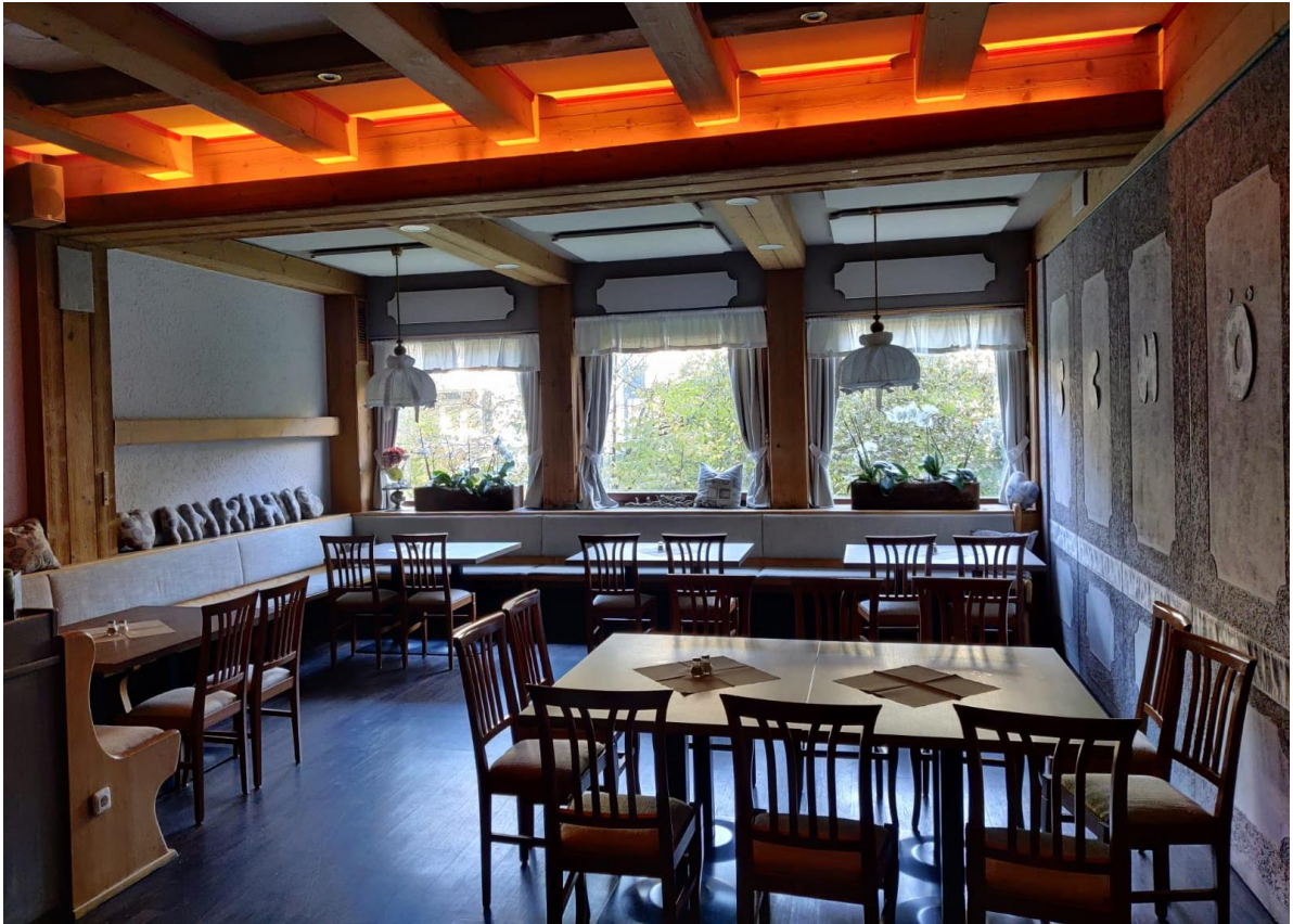
It looks a bit 'dark and dull' now without use...