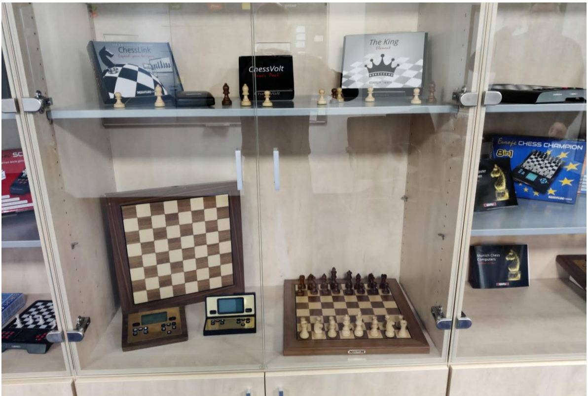
This display case shows a number of products that have been developed over the years, and they should be proud of that!