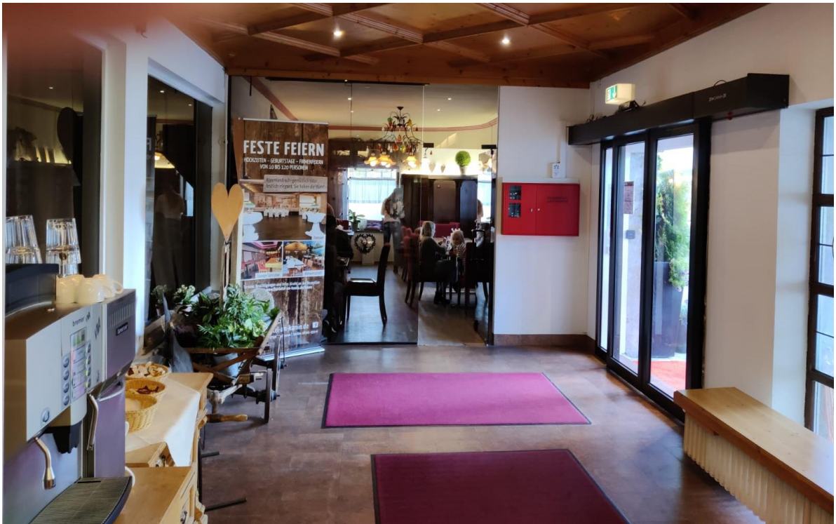
The main entrance of Hotel Am Kamin. The room in the background might also be suitable for the next tournament?