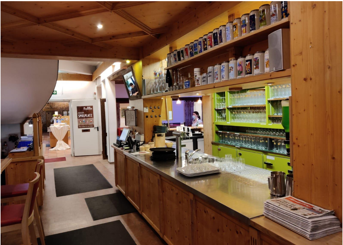
Again, what a beautiful hotel. Want to read a newspaper? They are ready and waiting for you!