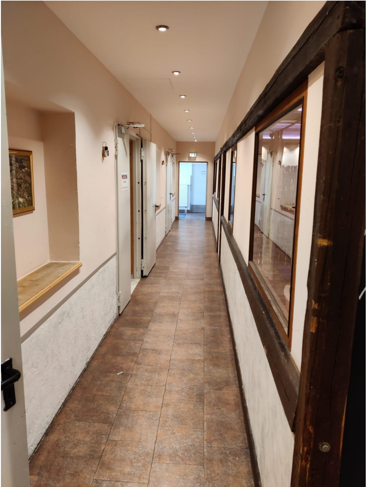
Next to the 'Sprizzbar' is a long corridor leading to the second car park. To the left of this corridor is a bowling alley and a children's play area.