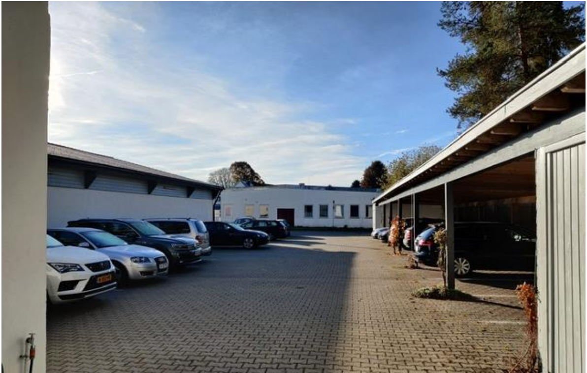
This second car park of the hotel is a bit hidden. Here, too, there are a number of places to park the car under a roof.