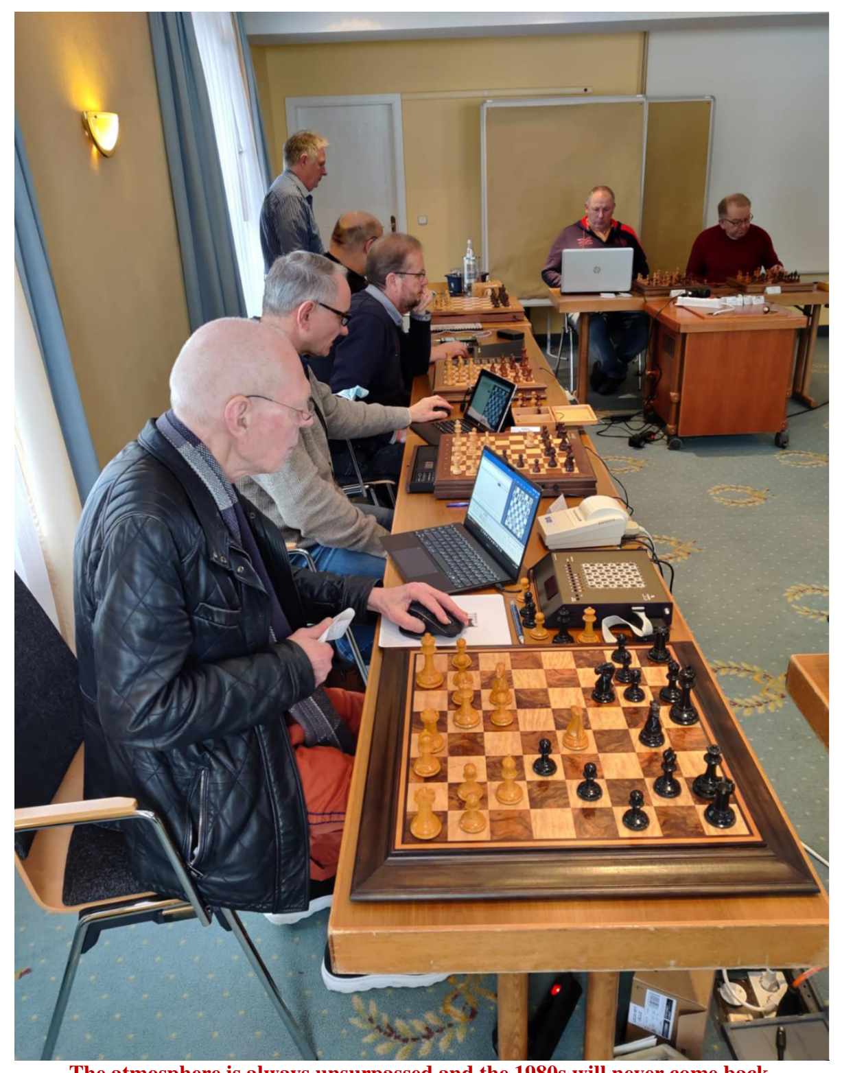
The atmosphere is always unsurpassed and the 1980s will never come back, but in Klingenberg we can enjoy all those wonderful chess computers that came onto the market back then, year after year...