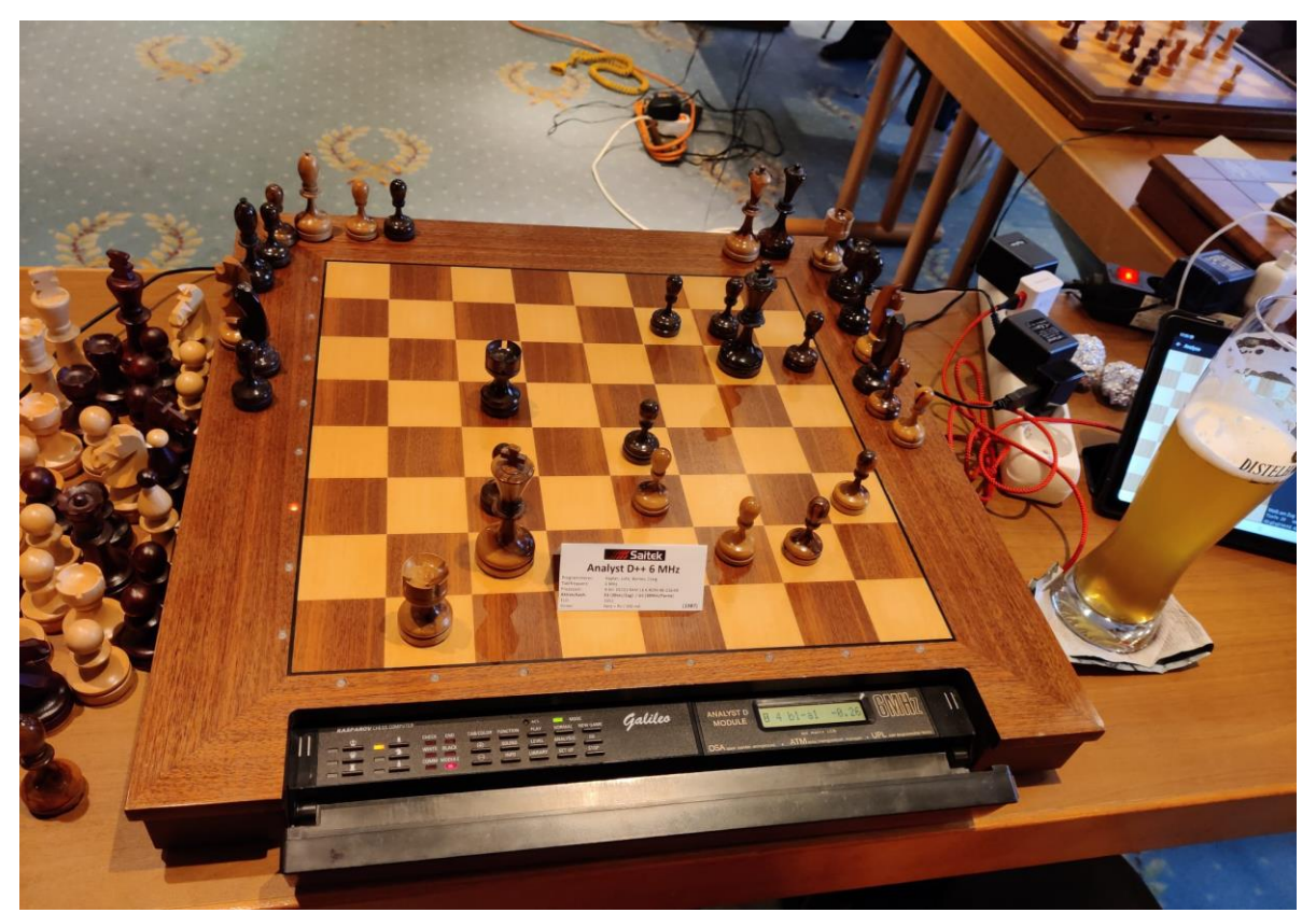
Saitek Galileo Analyst D++ 6 MHz by Julio Kaplan. https://www.schach-computer.info/wiki/index.php?title=Saitek_D%2B%2B