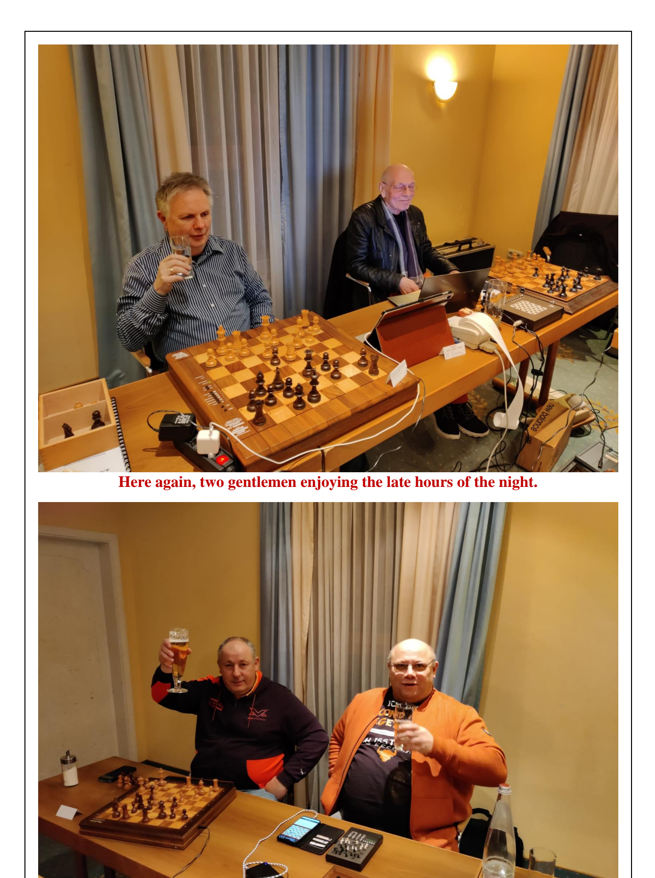
Yes, and what do you do then? Simply enjoy being together.