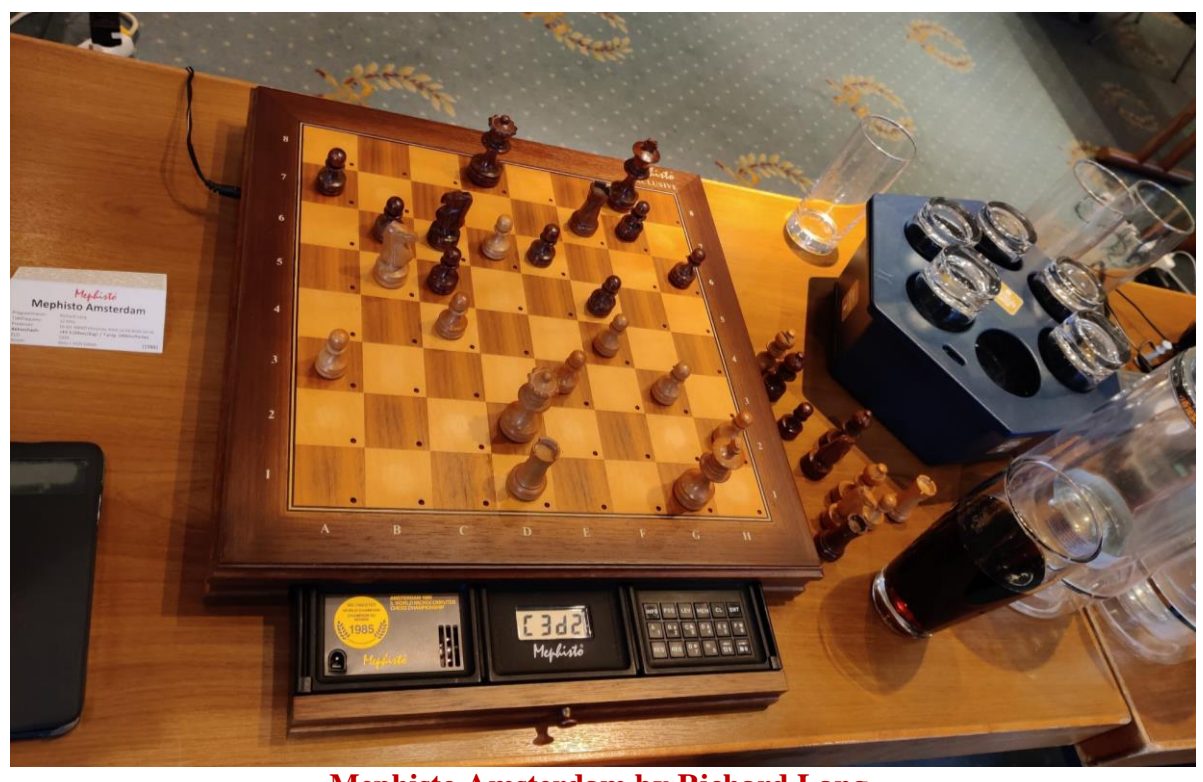
Mephisto Amsterdam by Richard Lang. https://www.chessprogramming.org/Mephisto_Amsterdam

Sargon ARB 4.0 24 MHz by Dan & Kathe Spracklen. https://www.schachcomputer-online-museum.de/projektarbeit-traumcomputer/chafitz-arb-4-0-50-s-16-mhz/ https://www.schackcomputers.nl/hein_veldhuis/database/files/06-1984%20%5bE-0201%5d%20Applied%20Concepts%20-%20Grandmaster%20Series%20Sargon%204.0.pdf