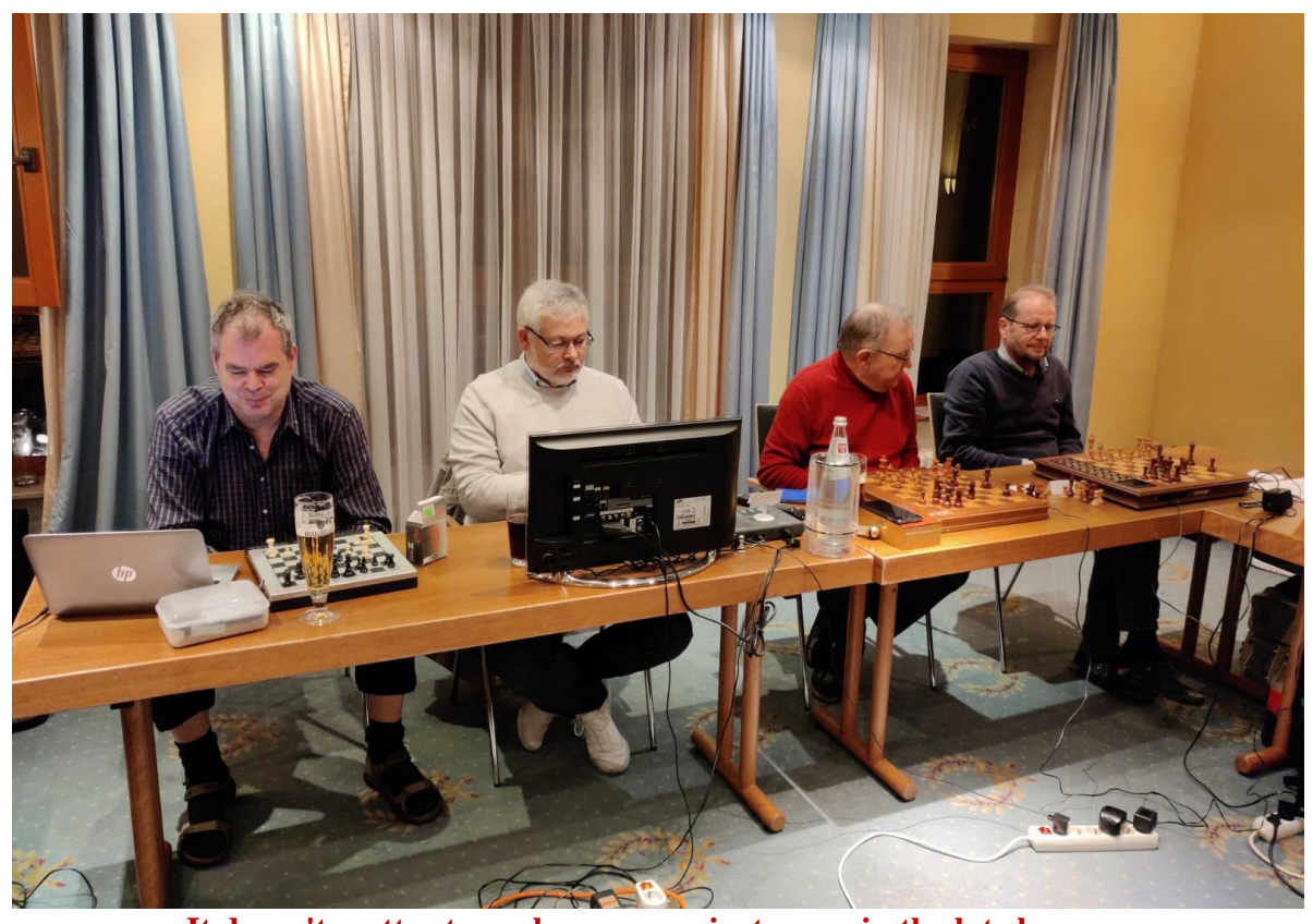
It doesn't matter to us, because we just go on in the late hours...

Yes gentlemen, get yourselves ready for the photo... It looks as if it is already late in the day, because in the background the dividing door has been closed in order not to disturb the guests in the rooms as much as possible.