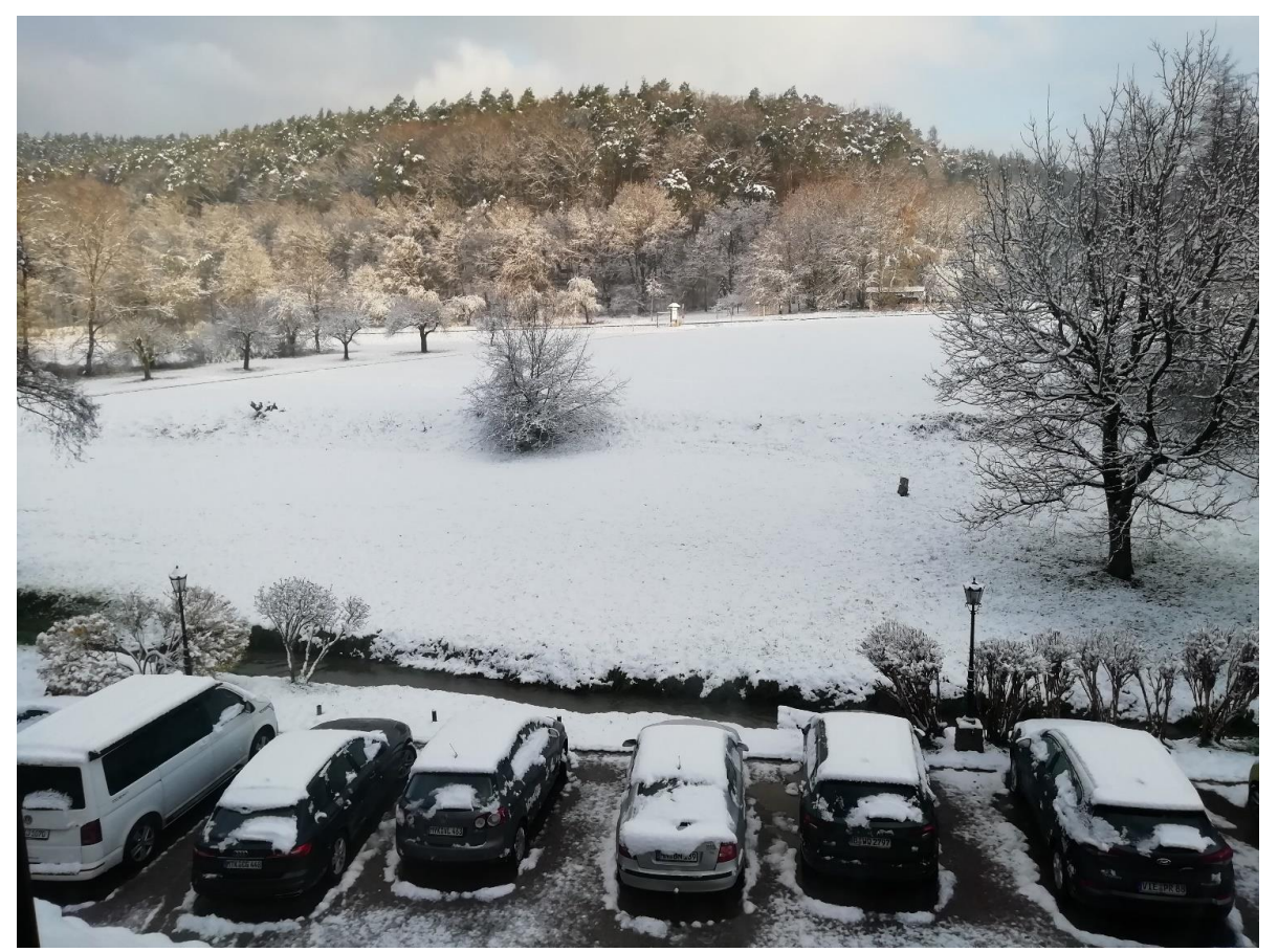
In the background, a few months ago, I took a walk on the hills of Klingenberg. That was during the meeting about the new upcoming chess computer of Millennium. Sometimes I got tired of listening to those endless discussions...