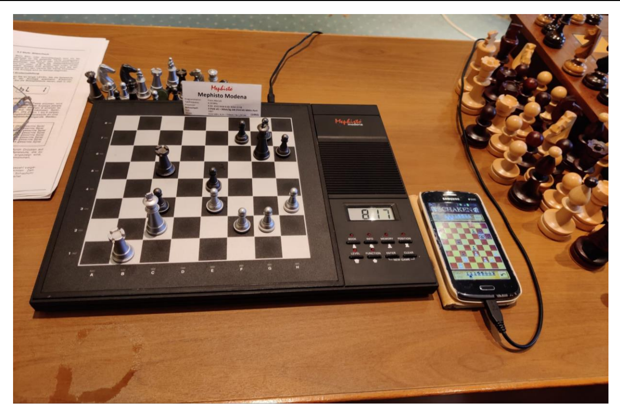
Mephisto Modena with a programme by Frans Morsch. https://www.schach-computer.info/wiki/index.php?title=Mephisto_Modena