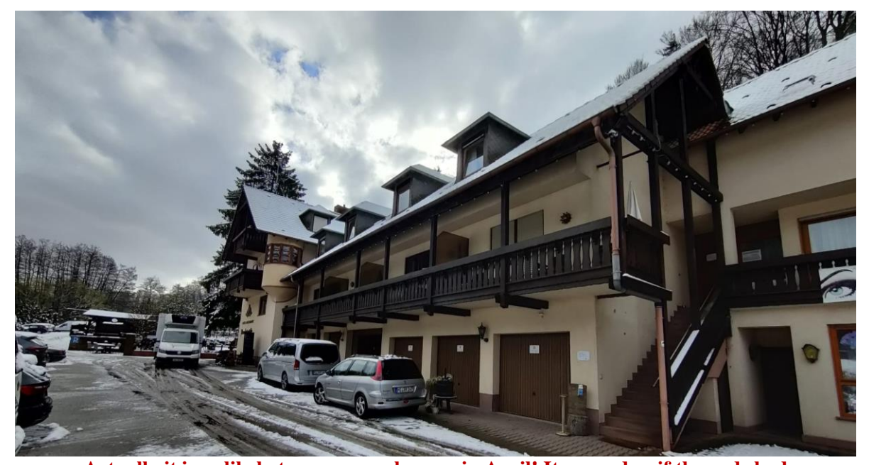
Actually it is unlikely to see so much snow in April! It seemed as if the gods had asked it to descend exactly on Klingenberg. Even the German teletext paid attention to it, and that says enough for such a small village as Klingenberg am Main...

Since 2004 we have been continuously visiting the German computer chess tournaments in Kaufbeuren and Klingenberg from the Netherlands. We can safely say that we belong to the 'diehards'. Why do we feel the need to visit these tournaments again and again? It is simply a total picture. Each event is incomparable with a previous edition because each time you see new participants with different chess computers! A journey by car to Kaufbeuren or Klingenberg is an experience in itself. Sometimes you can drive more than 200 km per hour, but you can also end up in a traffic jam or worse, have a breakdown. That is why, in recent years, we have always driven with two cars in order to be able to deal with any problems en route together.