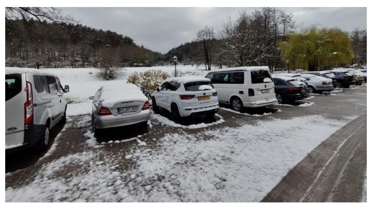
It was quite busy in Klingenberg this weekend. Not only the chess tournament, but also a group of about 40 guests who were celebrating another party. Yet there was enough space to park.