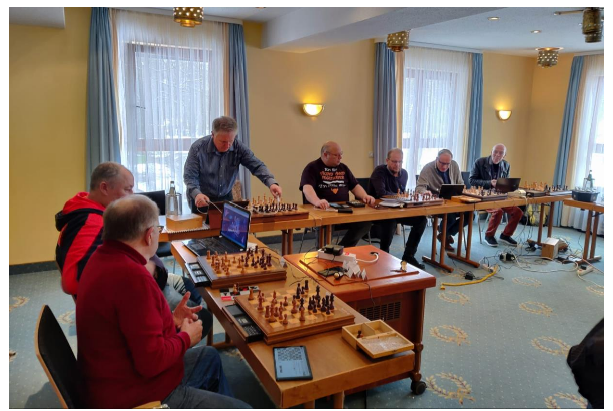
Yes, this is how a chess computer tournament should look like! And if you look through the windows you can see the winter scene as well.