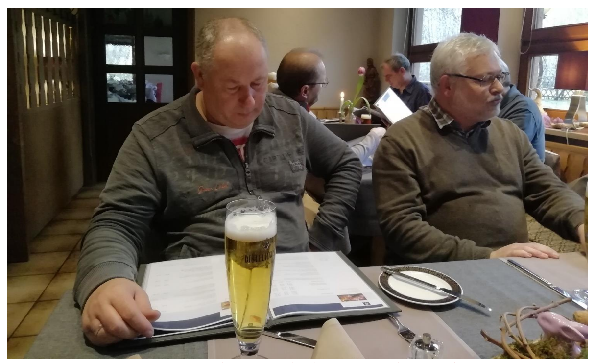
Not only chess, but also eating and drinking together is part of such an event.