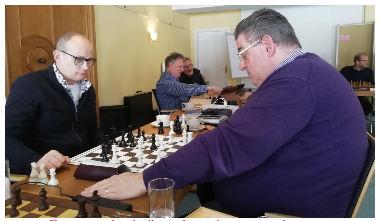
Here are two chess-hooligans who are always very much present...