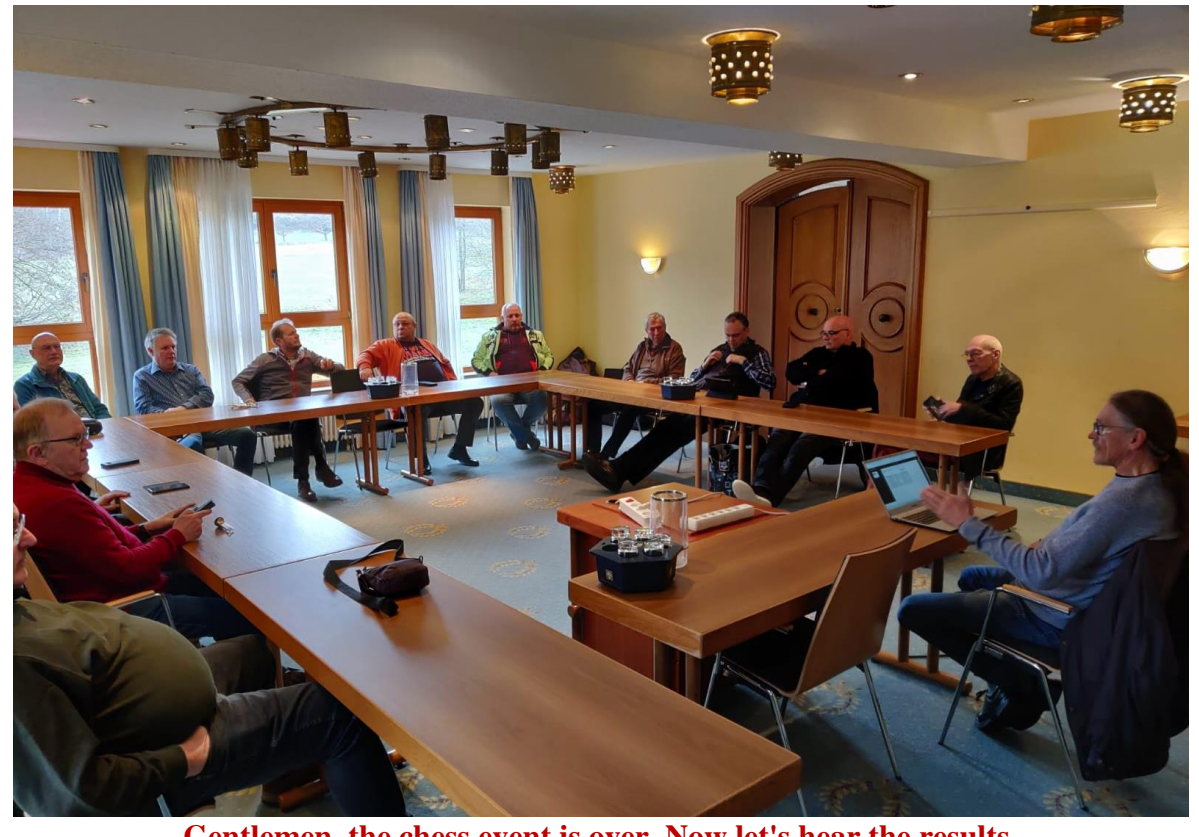
Gentlemen, the chess event is over. Now let's hear the results.