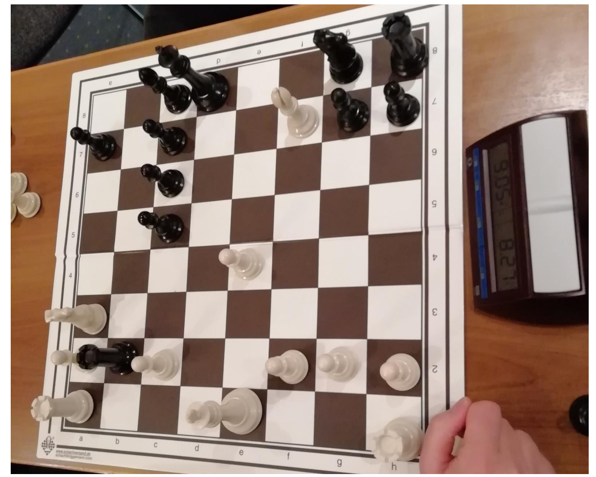
And with our Wild West chess, you often get the strangest positions on the board. Do you see that triple pawn? It makes no sense at all, but we always have a lot of fun!