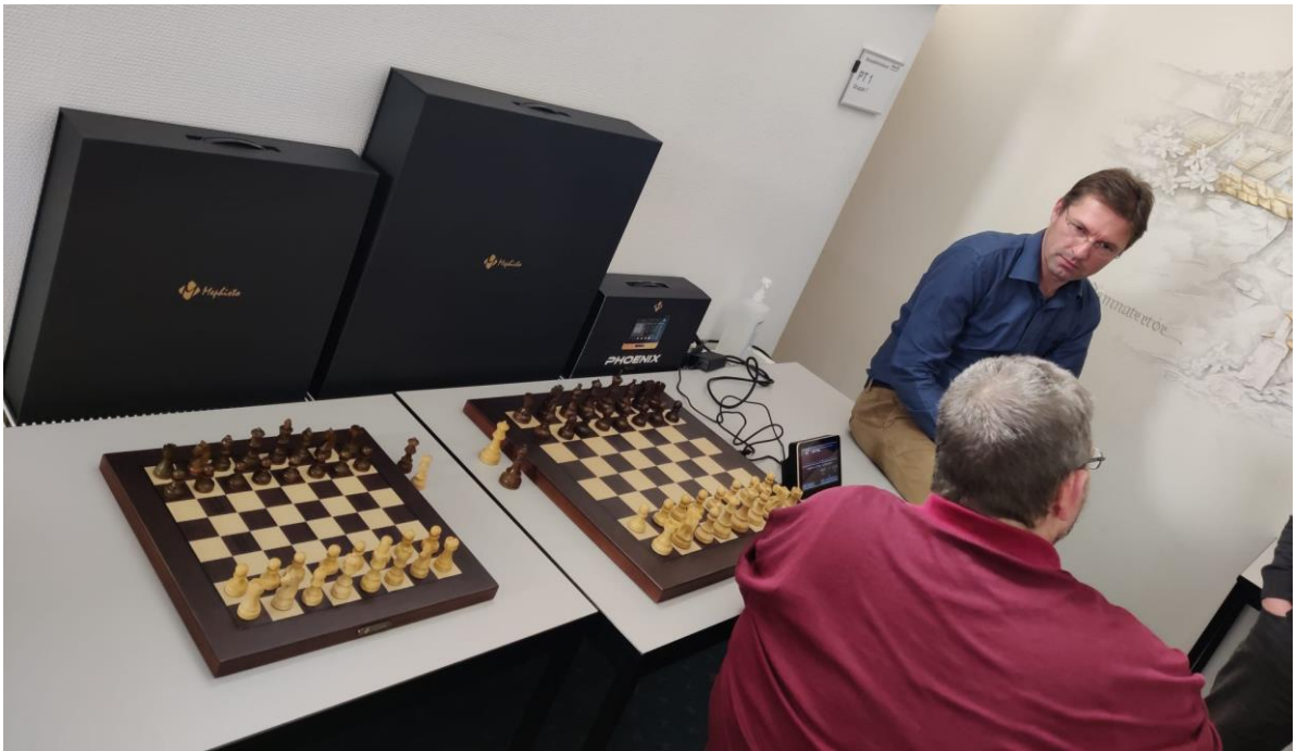
Here are some more discussions between the 'team members'.