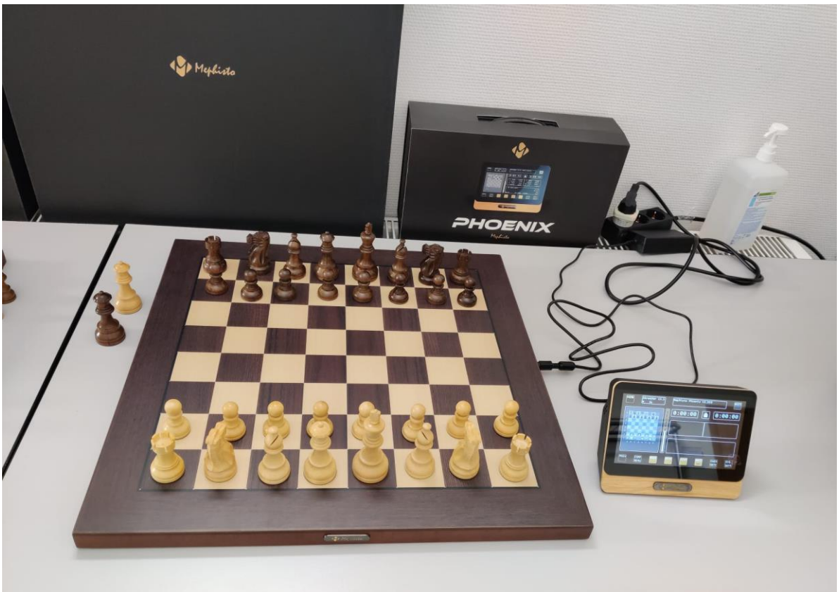
Mephisto Phoenix chess computer with tournament chessboard (55 cm) incl. piece recognition, LED move display and real wood pieces. The module contains 4 top engines as well as neural engine technologies and reaches up to 3400 Elo playing strength. 23 classic chess computer emulations from the 80s and 90s are also included.