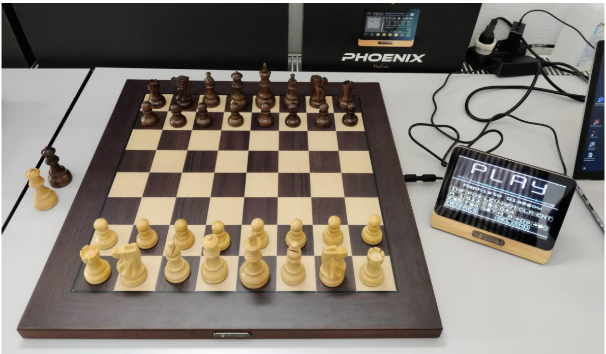
In the most deluxe version, i.e. with tournament board and incl. emulation package, this chess computer will cost € 1,999,-.