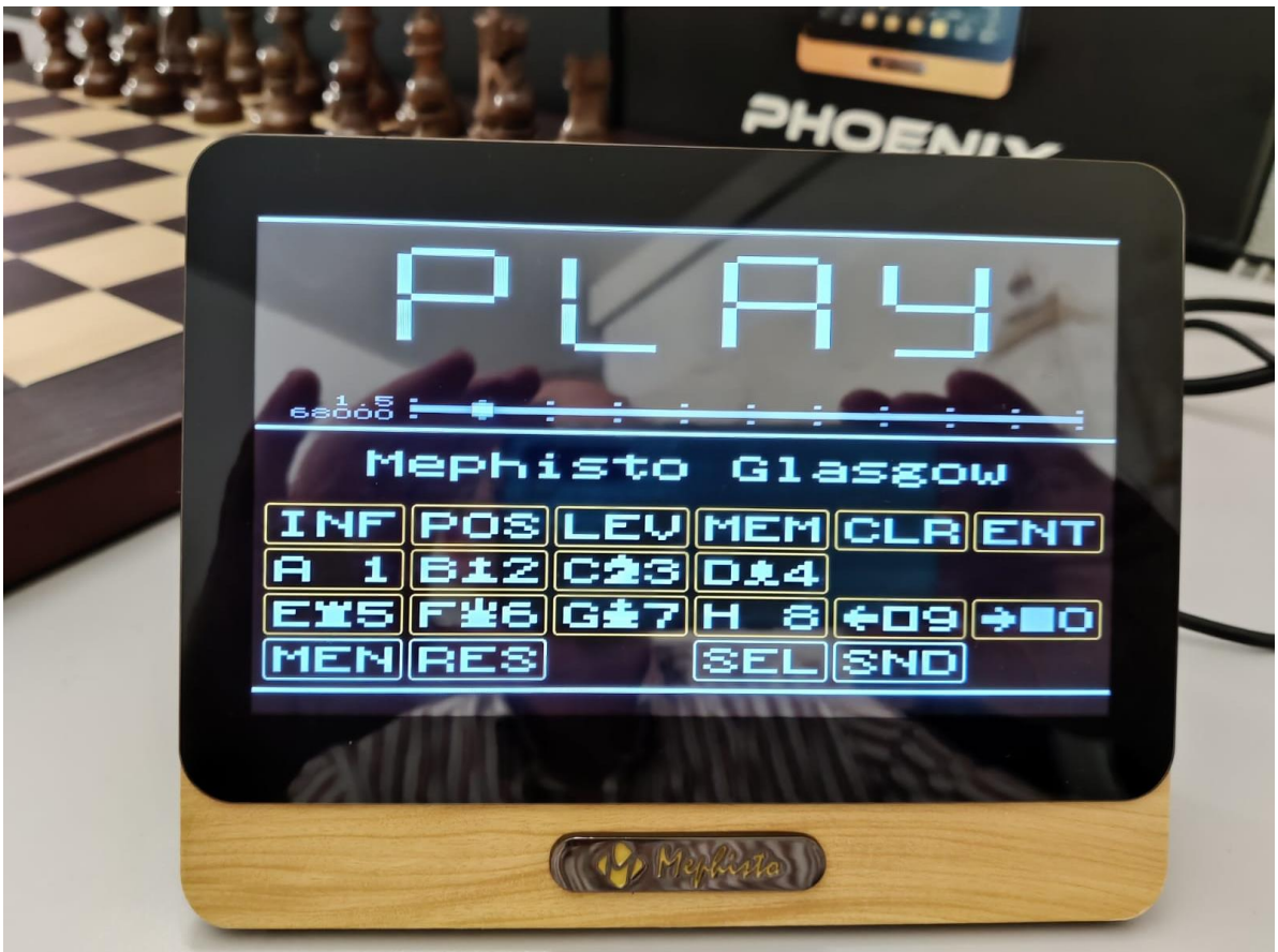
The operating module looks beautiful. The emulated Glasgow programme is highly sought after by collectors for its human playing style.