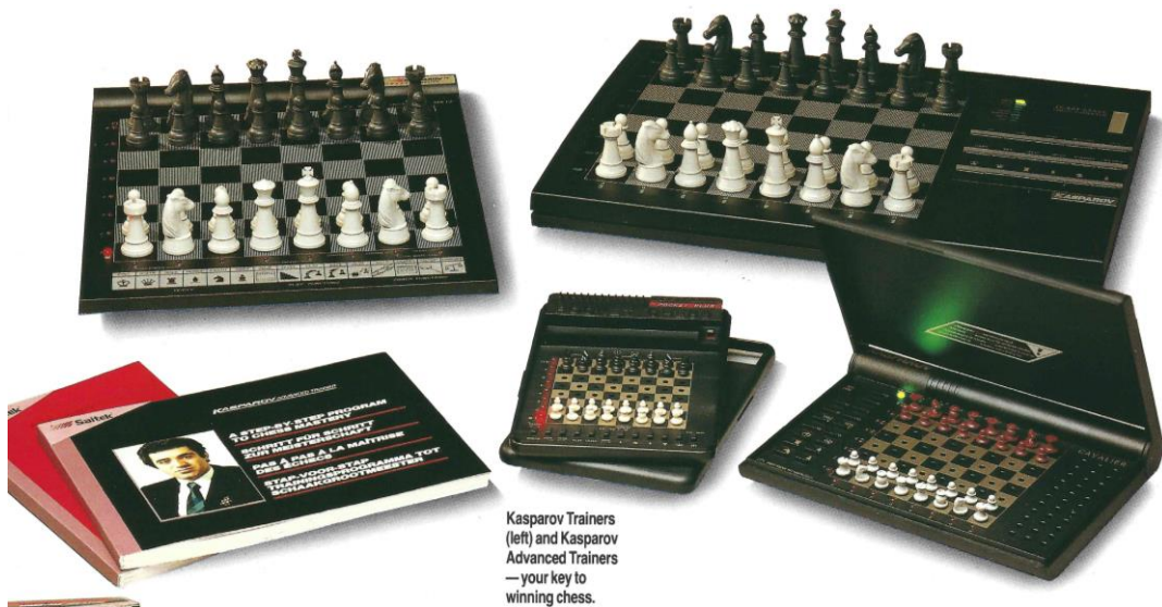
Kasparov Trainers (left) and Kasparov Advanced Trainers — your key to winning chess.