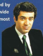
Garry Kasparov Chess champion of the world

Saitek has been at the forefront of this development, and has been responsible for many of the most interesting innovations. I have been personally associated with the company since 1983 and can therefore speak about its products from experience. It is the only chess computer company under Swiss management, so you know you are assured of quality and precision backed by a world wide guarantee and most importantly - hours of fun!