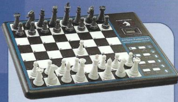
TABLE TOP CHESS