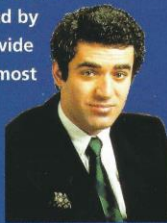
Garry Kasparov Chess champion of the world

Saitek has been at the forefront of this development, and has been responsible for many of the most interesting innovations. I have been personally associated with the company since 1983 and can therefore speak about its products from experience. It is the only chess computer company under Swiss management, so you know you are assured of quality and precision backed by a world wide guarantee and most importantly - hours of fun!